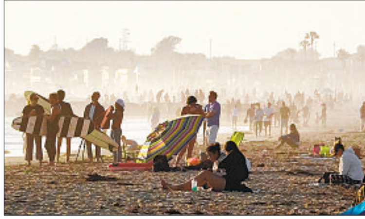
Beachgoers in Newport Beach on Thursday. Gov. Gavin Newsom has temporarily closed Orange County's coastline.

The compliant camp adheres to social-distancing guidelines and hygiene protocols, like hand washing. Many of these people wore masks even before the May 1 mask mandate. Their compliance may have limitations, however: If the economy were to reopen tomorrow, it's unclear that they would play along. In a recent KFF Health Tracking poll, nearly half of respondents said they would not resume public life until the national outbreak had subsided completely. "Better safe than