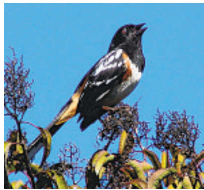
A spotted towhee, observed in San Diego during the international City Nature Challenge

Expanded nesting grounds could be jeopardized by renewed beach use, however, as San Diego County coastal cities roll out plans to reopen beaches over the next week. Still, large groups won't be allowed, and social-distancing restrictions — imposed to prevent COVID-19 infection — could also safeguard ground-nesting birds. Beachgoers should be aware of possible nest sites, and steer clear of them if they see them, said Hans Sin, a sen-